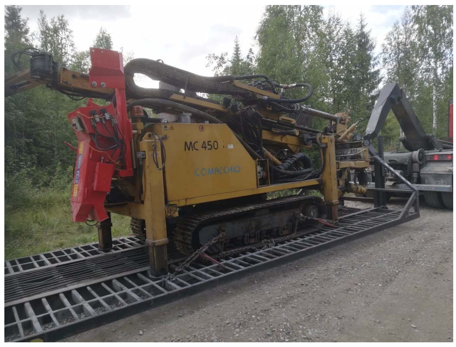
Figure 3: RC Drilling rig mobilized to site at Rompas